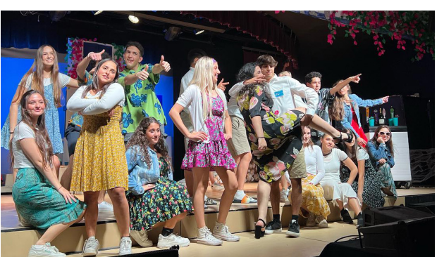
Scenes from Mamma Mia