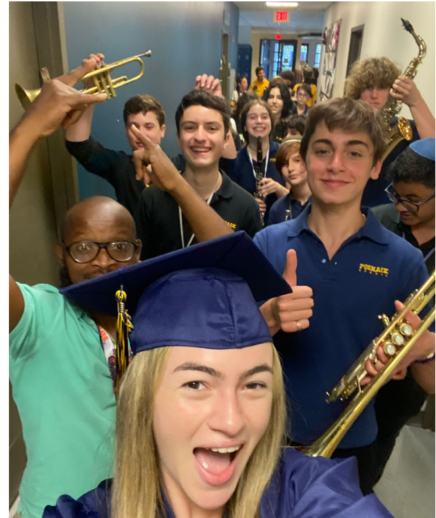
Marching Band Preparing to Perform for Seniors

The PVA faculty, combined with a return to live performances, made this year in arts incredibly special. Art will always be from the heart here at Posnack School!