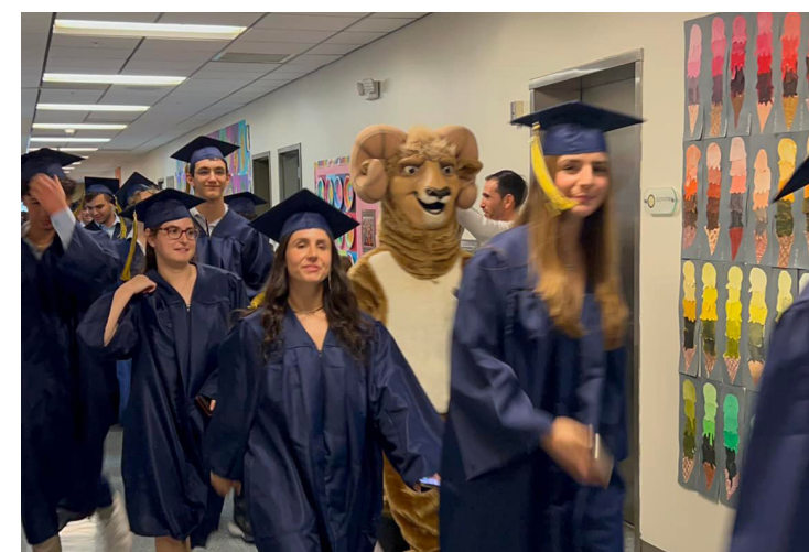
Seniors walking thorugh halls before awards ceremony

run and find your interests for college."